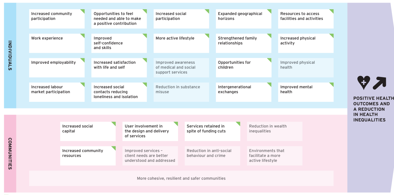
FIGURE 1 HOW EARNING AND SPENDING TIME CREDITS CAN LEAD TO POSITIVE HEALTH OUTCOMES

Indicates strongest evidence of positive outcomes